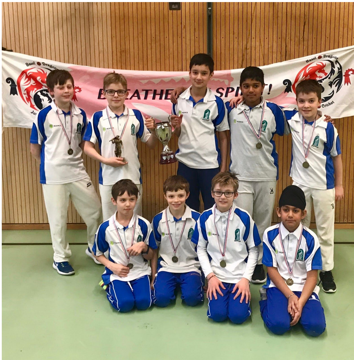
The winning Zurich team

Zurich went one better than their last tournament managing to retain the trophy even when facing some excellent competition from Basel. What impressed most was they kept their heads up even when panic threatened.